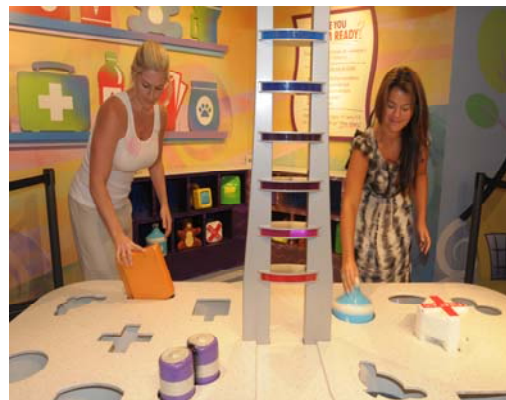
Interactive game at the Stormstruck exhibit in Epcot