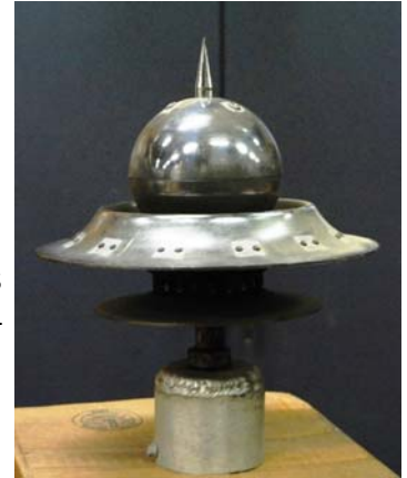
ABOVE: A Heary Brothers

In October, a Federal Court in Arizona granted East Coast Lightning Equipment's Motion for Compliance with a Court Ordered Injunction that corrects false advertisements made by Early Streamer Emission (ESE) lightning protection system vendors Heary Brothers Lightning Protection / Lightning Preventor of America and National Lightning Protection. East Coast filed a motion earlier this year asking the court to review recent advertising and promotional materials distributed by the ESE vendors that appeared to violate the injunction the Court issued in October, 2005. The Court agreed with East Coast's motion and ordered Heary Brothers and National to comply with the Injunction or suffer contempt of court as well as possible sanctions and damages.